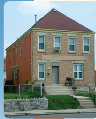
This "before and after" multi-family renovation photo was taken at the property located on the corner of 7th Avenue and Summit St. in Columbus, Ohio.