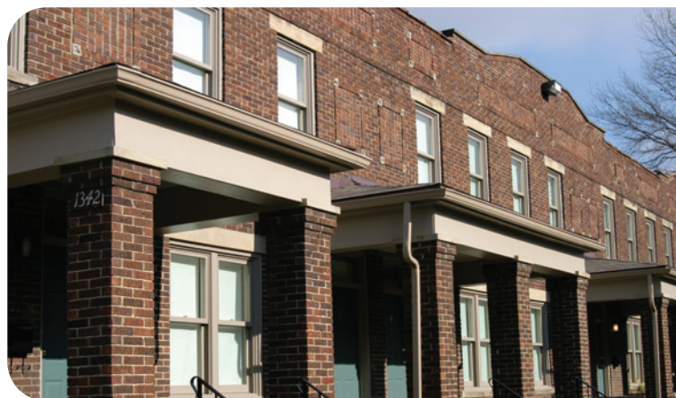
A CPO townhouse located in the Weinland Park neighborhood in Columbus adjacent to The Ohio State University

The new non-profit management corporation, Community Properties of Ohio Management Services (CPO), an OCCH affiliate, opened its doors in April 2003. The first task of business was the rehabilitation of the portfolio and the implementation of supportive services for the residents.