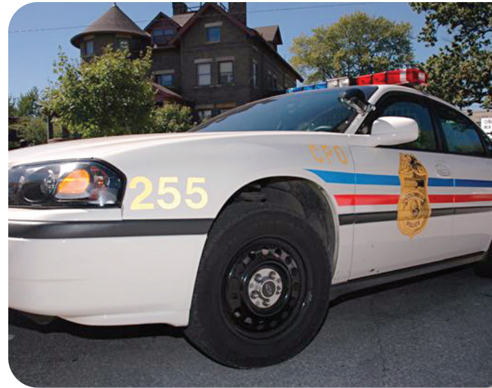
The CPO police cruiser patrols the portfolio's neighborhoods, helping to increase the safety of residents.

It is CPO's mission not only to eliminate the criminal element, but also to provide the residents of the community with the tools to take ownership of their neighborhood and not allow criminal activity to saturate these areas as in the past.